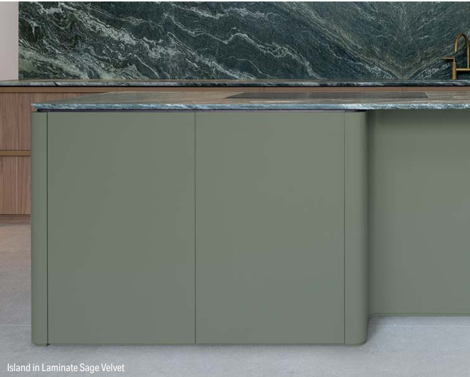
Island in Laminate Sage Velvet