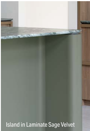
Island in Laminate Sage Velvet

Colourpyne's new High-Pressure Laminate (HPL) range is designed for curved joinery and horizontal surfaces, offering superior durability and style. These laminates perfectly harmonise with decorative doors and panels, ensuring a cohesive look across every element of your project. With a curated selection of colours, Colourpyne HPL provides a high-quality, versatile solution for both residential and commercial applications, delivering a premium finish that enhances the longevity and functionality of your design.