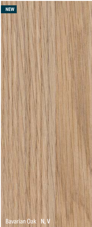
Bavarian Oak N, V